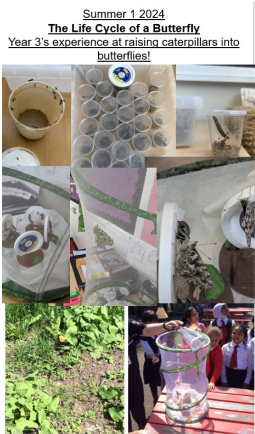
Summer 1 2024 The Life Cycle of a Butterfly Year 3's experience at raising caterpillars into butterflies!

To recognise the girls raising butterflies from caterpillars to butterfly, we created a collage of the life cycle of a butterfly.