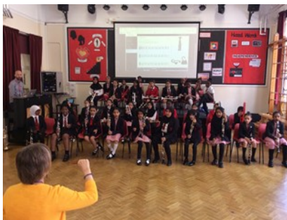
Our Pupils also showcased their musical talent at our SoundStart concert.

In PSHE, pupils discussed changes that have been and may continue to be outside of their control and ways of managing the feelings associated with those changes.