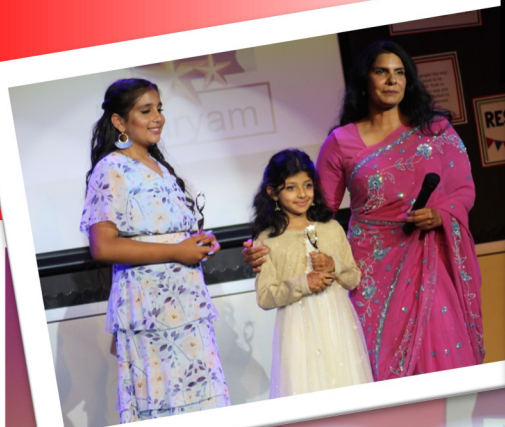
The Prize Giving